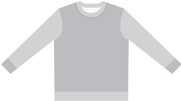
FRONT - KIDS