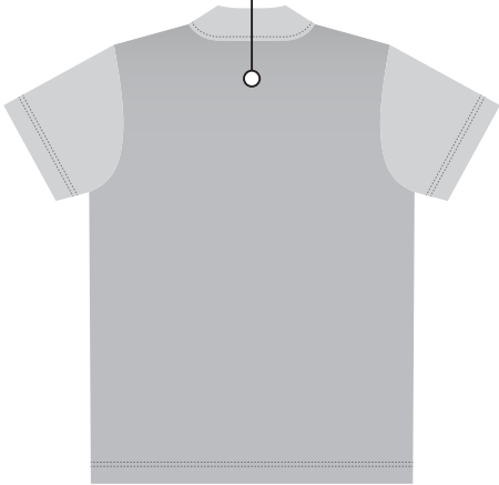
BACK - KIDS