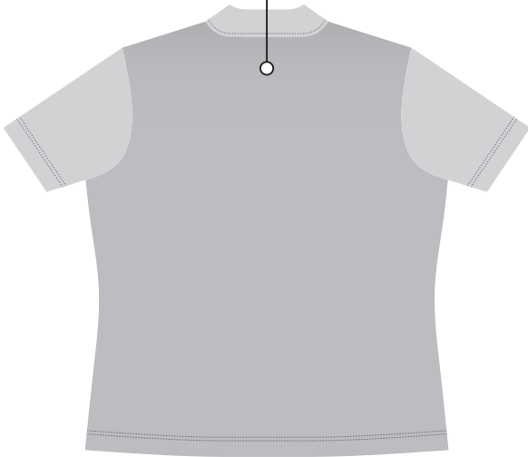
BACK - WOMEN