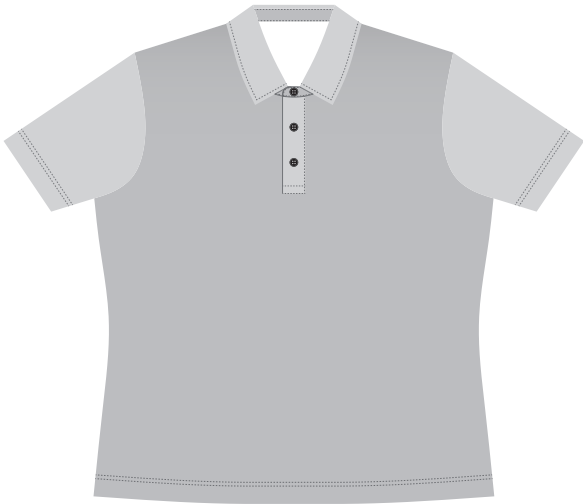
FRONT - WOMEN