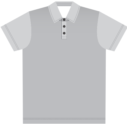
FRONT - KIDS